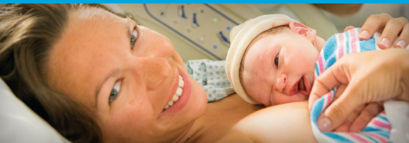
Fall In Love

When the magic day comes, Mother Nature will do most of the work for you. Follow these simple tips to help you and your baby get off to a great start!