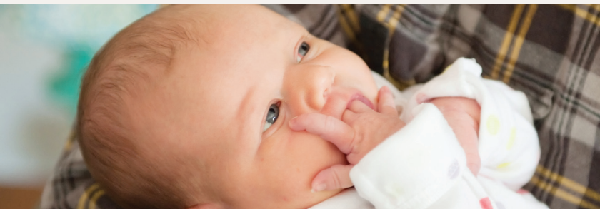
Learn Your Baby