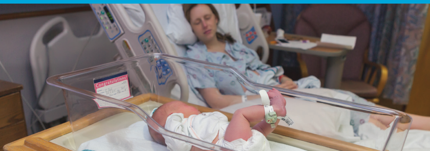
Keep Baby Close